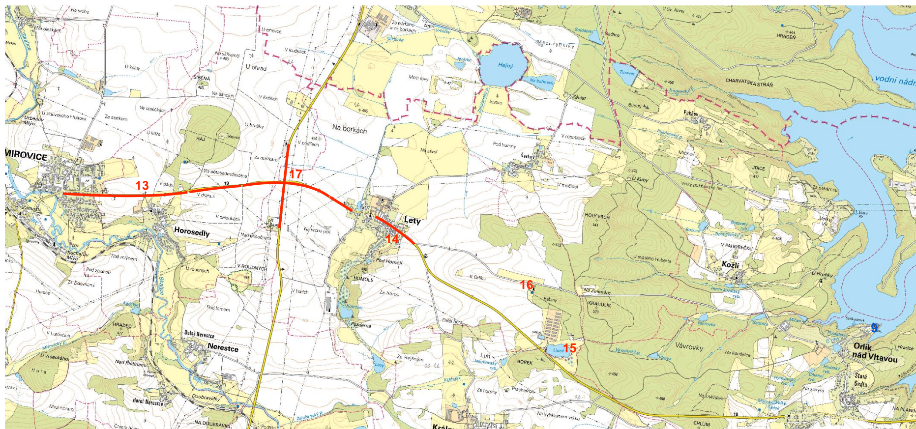
Map 2 – Problems of the area and risks related to its future