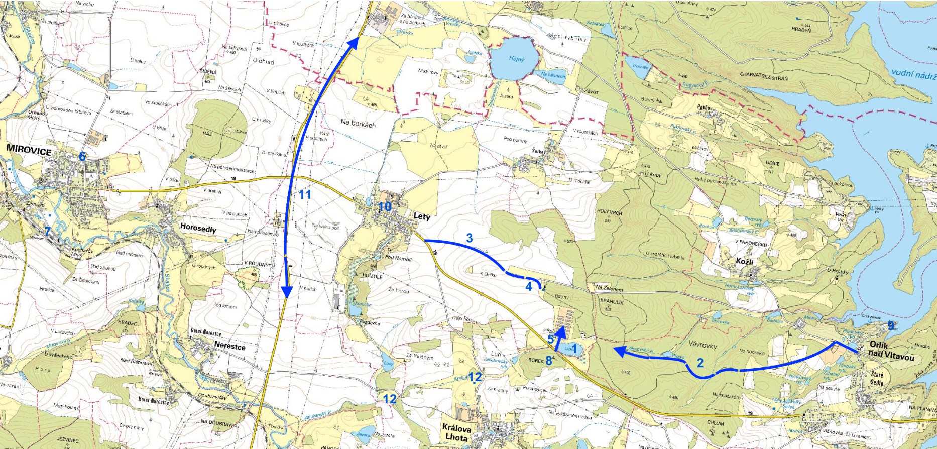
Map 1 – Values of the area and opportunities associated with its future